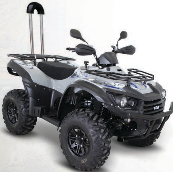
BLADE 520 EPS