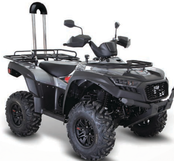
BLADE 600 SE